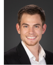
Mark Pinson Index Production and Analysis

The municipal bond market, as measured by the Standard & Poor's Municipal Bond Investment Grade Index, had a Total Return of -0.185% in April 2023, consisting of the components displayed in Table 1.